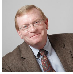
Paul A. Mitchell Partner